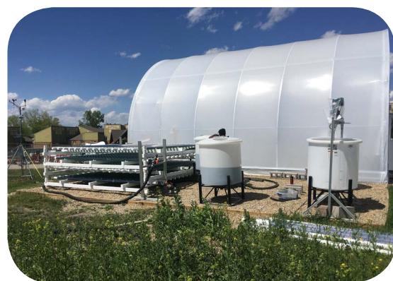
The pilot plant displayed over 140 days of crash free operation in a production environment.