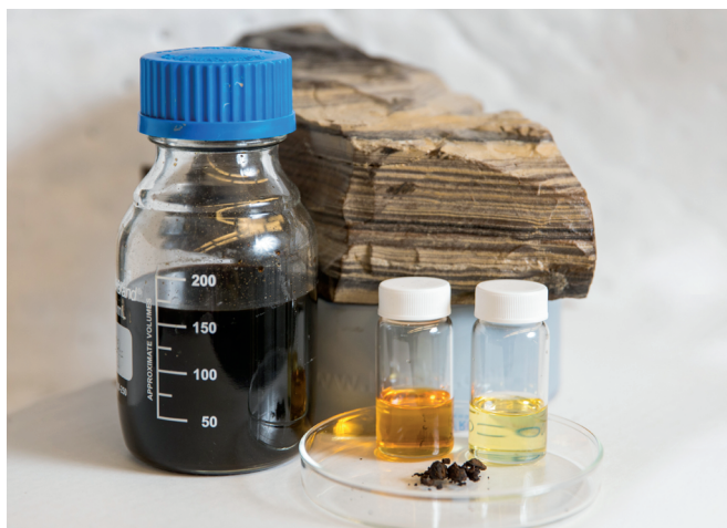
Kerogen Extraction from Oil Shale

Each challenge in the energy industry requires a unique solution, and we have developed a platform based on the design of ionic liquids. We develop technologies with higher performance and a smaller environmental footprint.