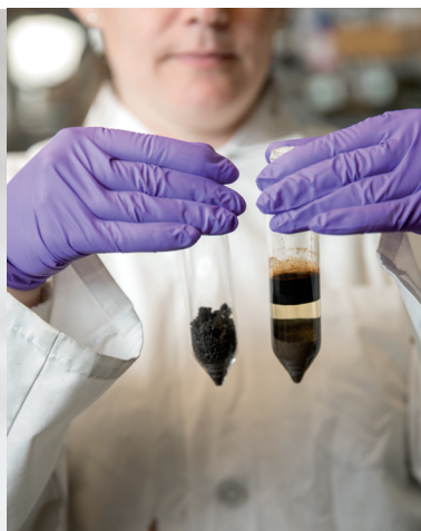
Room Temperature Bitumen Extraction